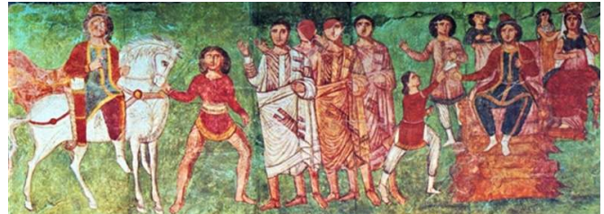
Story of Esther—Dura-Europos Synagogue (3rd cent.)

"The heavens are telling the glory of God," sings Psalm 19. "Their voice goes out through all the earth!" This Sunday will be a "Fiesta of Song," as we share God's music from around the world and across the ages. We'll also share Communion—both virtually with the recorded one and in-person in the outdoor service.